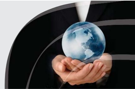
Figure 2 – Main messages from the 2008 sustainable development effectiveness review